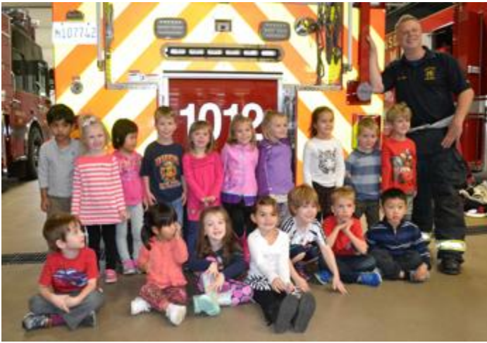
The JR/SR P.M. class visits the Hinsdale Fire Department as part of Fire Safety Week