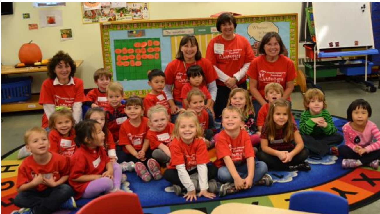
The JR/SR P.M. class showing off their spirit

Choose washable toys whenever possible. Toys can be washed by hand (with hot water and soap or detergent), followed by immersing toys in a sanitizing solution. Unscented household chlorine bleach is safe and effective for sanitizing toys. Chlorine evaporates off the toys so no residue remains. Mix \frac{1}{4} teaspoon of unscented chlorine bleach to 1 quart of cool water. Toys such as stuffed animals and play clothes can be washed in a washing machine using the hot water cycle. You do not need to immerse or wipe toys with a sanitizing solution if they are washed by machine. Finally, some hard toys such as wood, plastic or metal may be washed in a dishwasher. Run toys through the complete wash and dry cycle on the top rack only. You do not need to use a sanitizing solution with toys washed in the dishwasher. Laura Tortorello